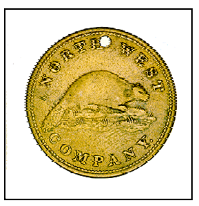
North West Company Brass Token, 1820 Photo: http://collections.ic.gc.ca Photos: