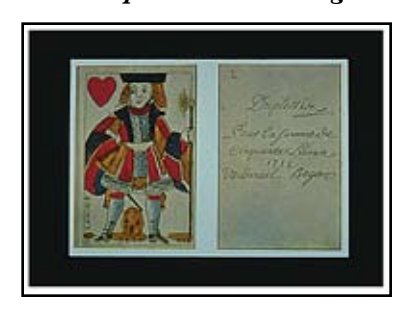
Reproduction of the 1714 issue of New France's playing card money