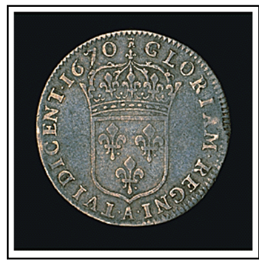
New France, Louis XIV, 15 sols, 1670, reverse