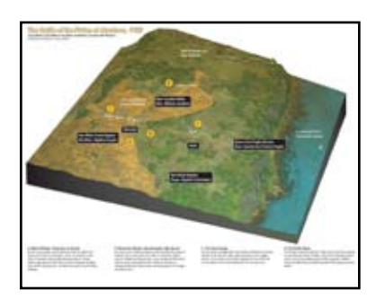
Scale Model of the Battle of the Plains of Abraham, © Canadian War Museum Illustration by Malcolm Jones, 2005

pencils, markers, pens, paper, access to computers and the Internet