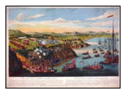
Taking of Quebec September 13th, 1759 Courtesy of Library and Archives Canada, C-139911

pencils, markers, pens, paper, access to computers and the Internet